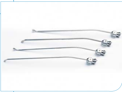
Kelly endonasal suction tubes