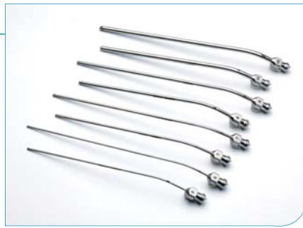
Atraumatic suction tubes