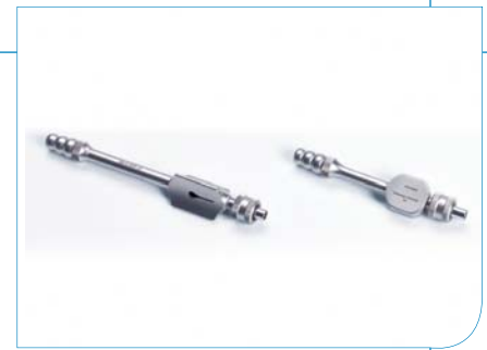
Triangular and flat handpieces