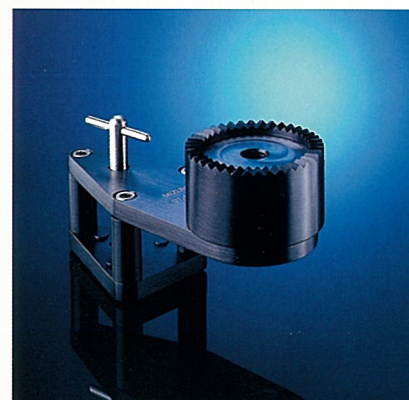
Starburst Navigation Adapter

Mizuho America, Inc. 123 Brimbal Avenue Beverly, MA 01915 Tel: 800-699-CLIP(2547) or 978-921-1718 Fax: 978-921-4003 EMAIL: mizuho@mizuho.com www.mizuho.com