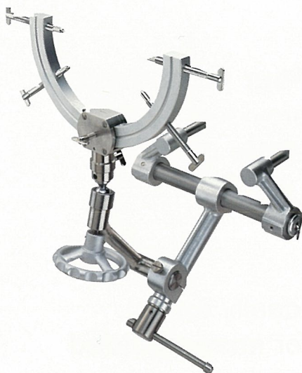
Four Point Head Holder